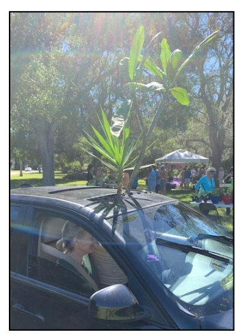
Thank goodness for sunroofs.