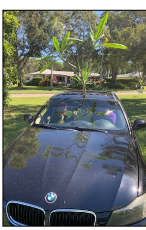
Who said trees need to be in the ground?