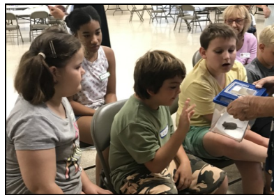
The Bat Lady With the Kids Looking at a Real Bat.